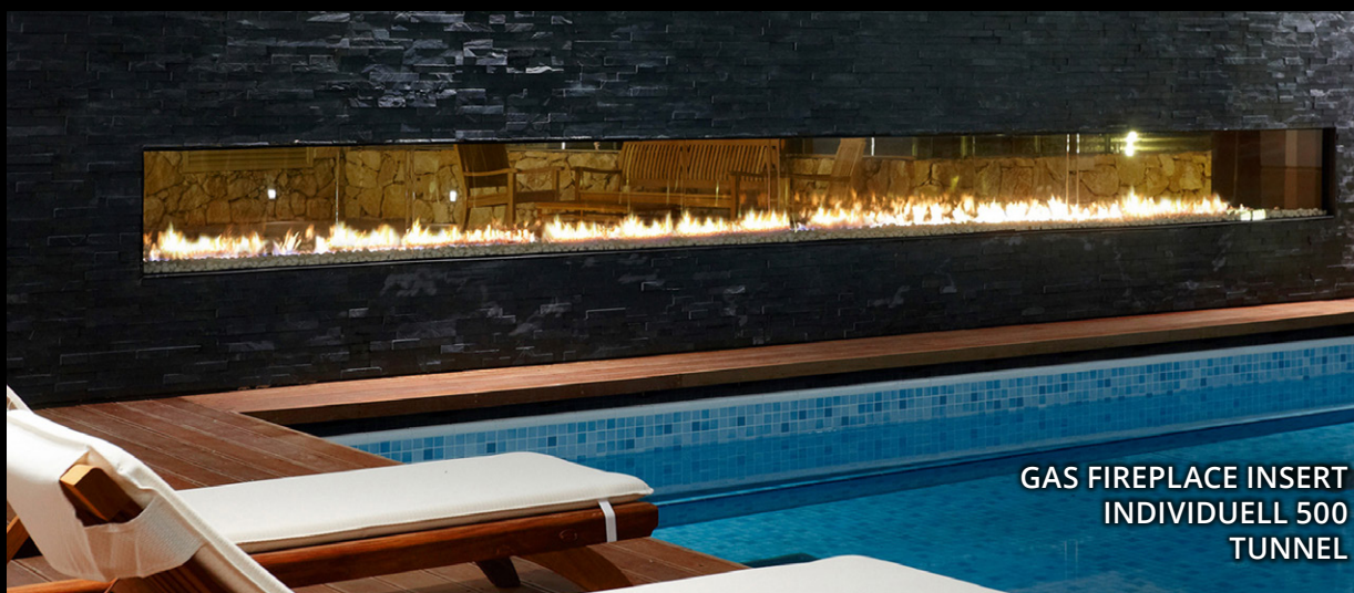
GAS FIREPLACE INSERT INDIVIDUELL 500 TUNNEL