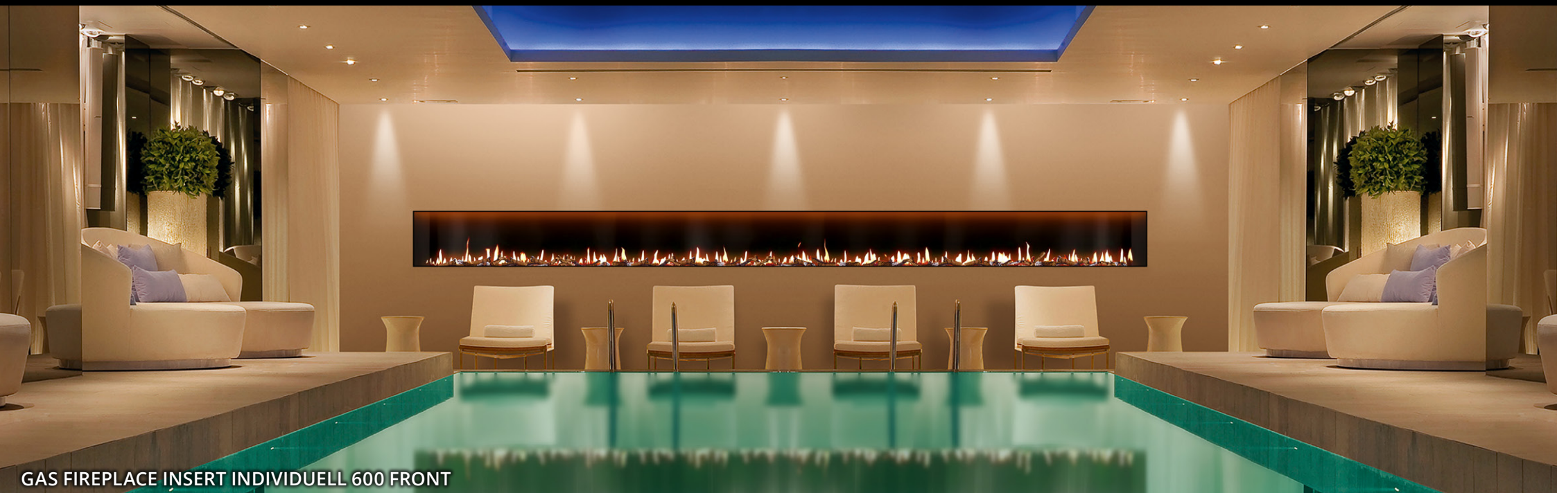
GAS FIREPLACE INSERT INDIVIDUELL 600 FRONT