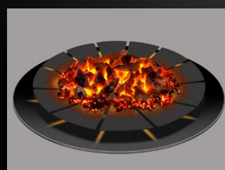
Schutzunterlage protection glass underlay